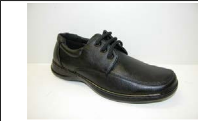
STYLE 43611006 SIZE A1, B3 COLOR BLACK