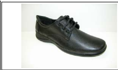
STYLE 23611005 SIZE M2, M4 COLOR BLACK