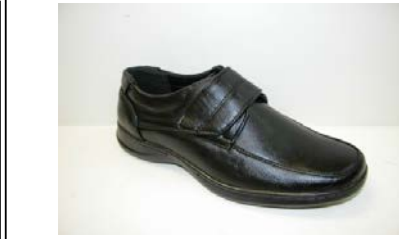
STYLE 43611002 SIZE B3 COLOR BLACK