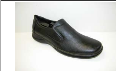
STYLE 23611009 SIZE M2, M3, M4 COLOR BLACK