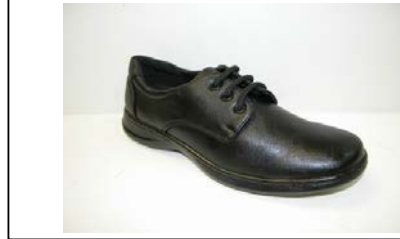
STYLE 43611005 SIZE A1, B3 COLOR BLACK