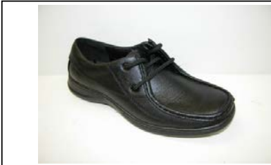
STYLE 43611001 SIZE A1, B3 COLOR BLACK

831 NW 21 STREET MIAMI FL, 33127 TEL: 305-545-0701 FAX: 305-545-0704 E-MAIL: INSHOES@OUTLOOK.COM