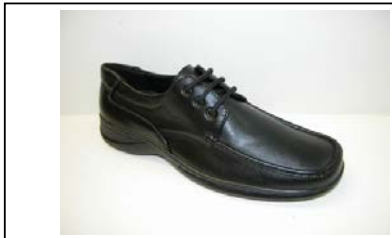
STYLE 23611003 SIZE M2, M3, M4 COLOR BLACK