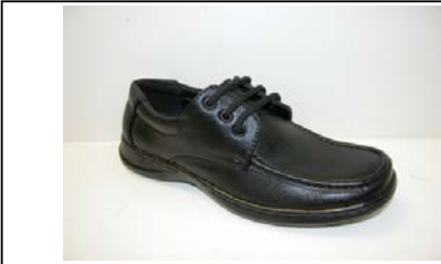
STYLE 43611007 SIZE A1, B3 COLOR BLACK