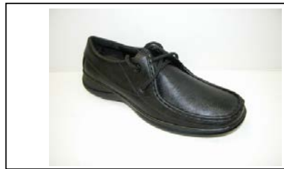
STYLE 23611001 SIZE M2, M4 COLOR BLACK